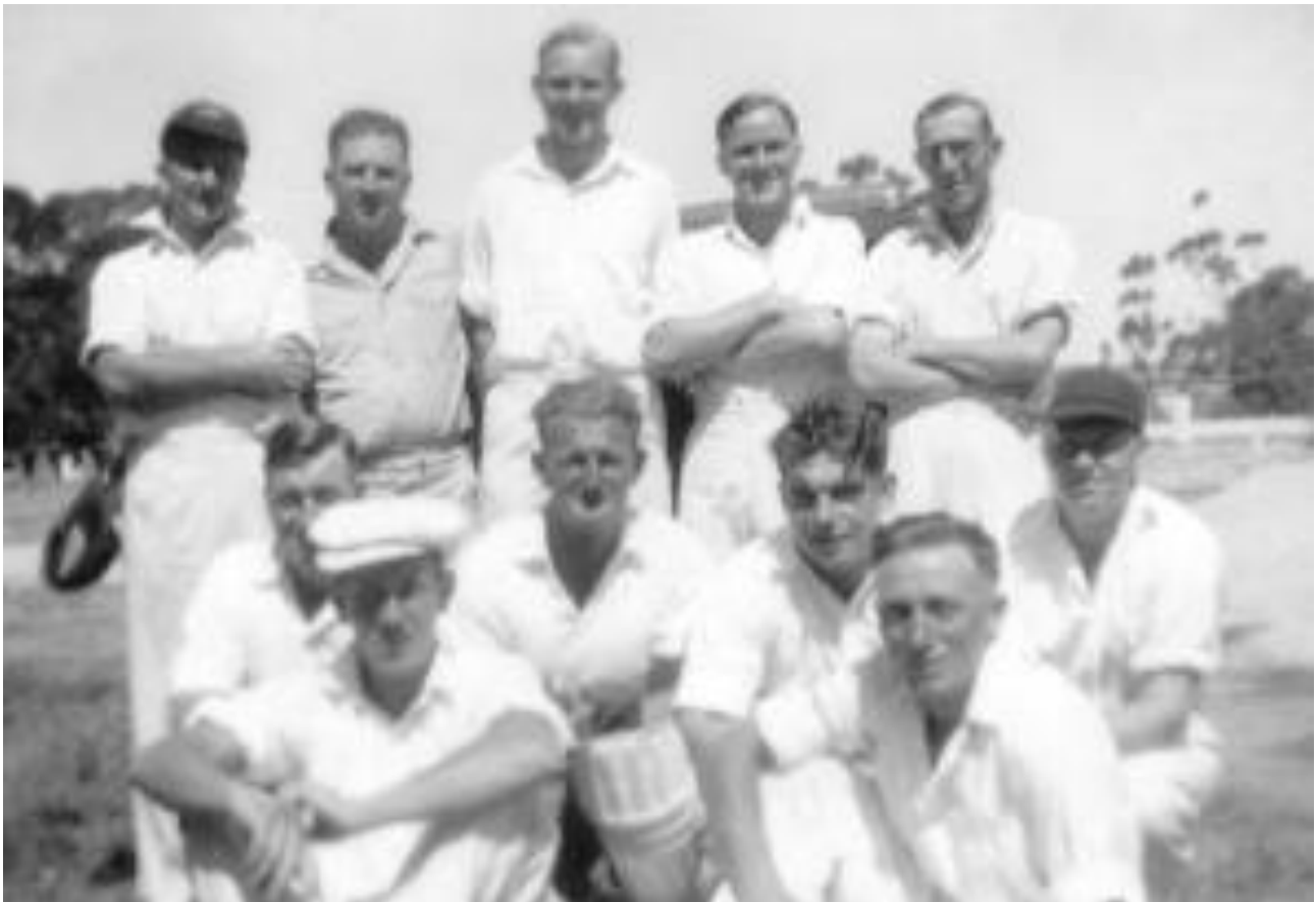
1946/47 Premiership team